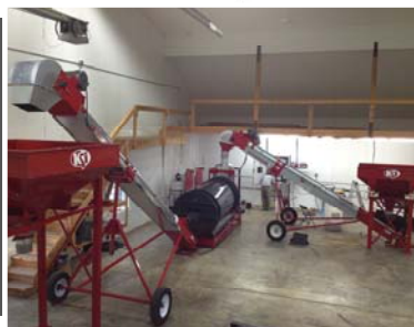
Stand-Alone and Bulk Systems